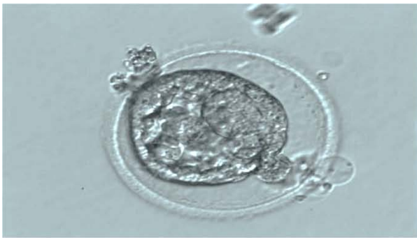
Fig. 1: Human embryo of the 5th day of development, the stage of the collapsed human blastocyst, immediately after defrosting. Boost: x200.

Embryos were taken for transfer, in which the number of intact cells was more than 50%.