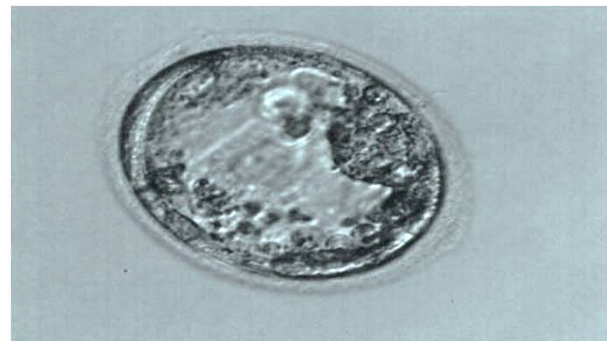
Fig. 2: Human embryo 5 days of development, human blastocyst stage 2 hours after thawing. Boost: x200.

To assess the structure of oocytes and embryos, a morphological method for assessing the quality of embryos was used using an inverted microscope Olympus IX-73 (Japan) and a Nikon SMZ-1000 stereomicroscope (Japan). Embryo vitrification was carried out in accordance with the manufacturer's freeze/thaw protocol (Irvine Scientific, USA). To assess the viability of the embryo, its morphological assessment was performed immediately after thawing (Fig. 1) and 2 hours after thawing (Fig. 2).